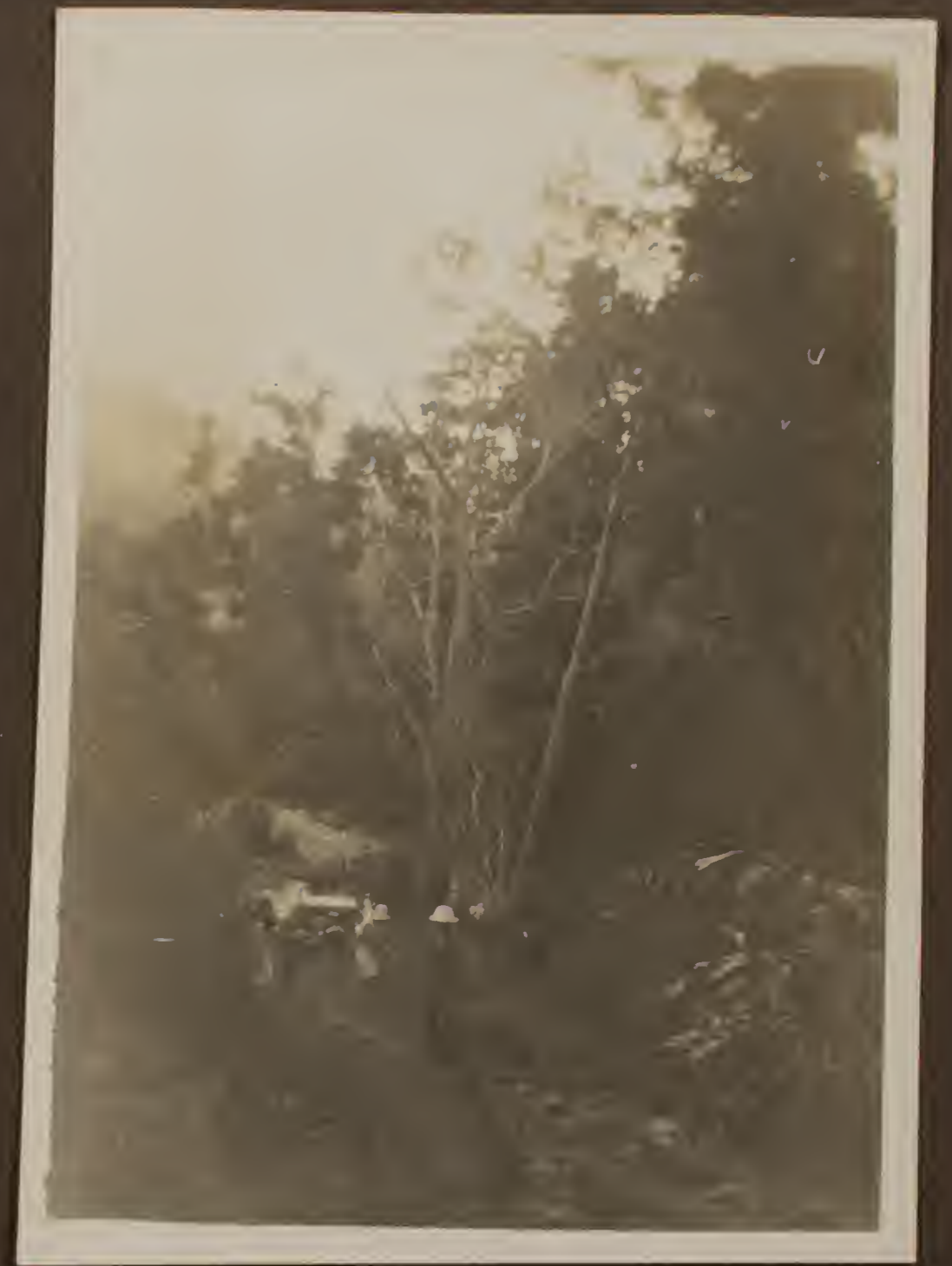
Scene of Molok Inlet 15 July 28